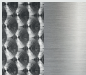
Finitura esterna fiorettrata o satinata External marbled or satin polished Finition exterieure bouchonnée ou brossée