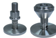
Piedi regolabili Adjustable feet Pieds réglables