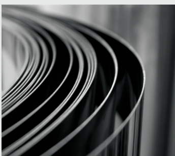
AISI 304 AISI 316 optional