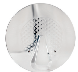
Fondo bombato riscaldato (optional) Heated roundly bottom (optional) Chauffé fond bombé (optional)