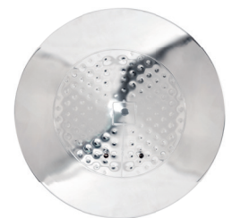
Fondo conico riscaldato (optional) Heated conical bottom (optional) Chauffé fond conique (optional)