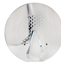
Fondo bombato riscaldato (optional) Heated roundly bottom (optional) Chauffé fond bombé (optional)